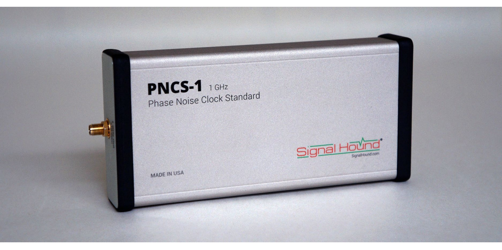
PNCS-1 1 GHz Phase Noise Clock Standard Product Manual